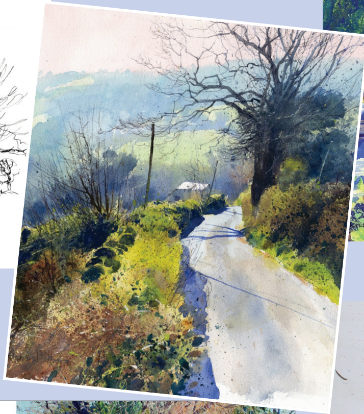
Right: DOWN MISTY VALE