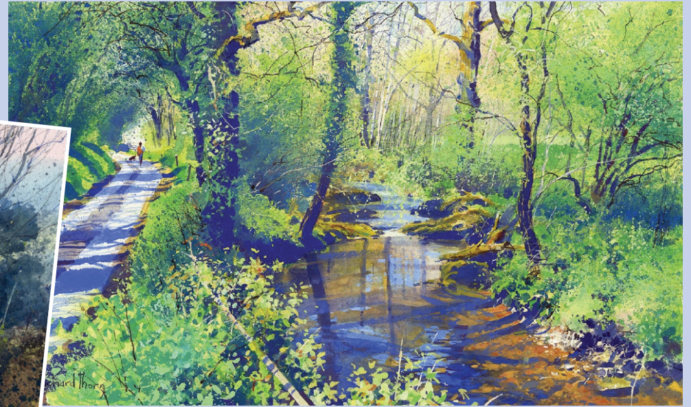
Above: LANESIDE Below: NEAR DUNSFORD (sketch)